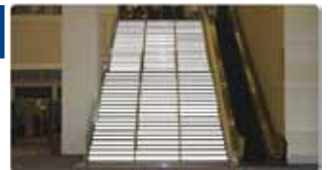
EXHIBIT HALL SIGN COVERS: $2,000 EACH

Along Pre-Function Space to Prince George's Exhibition Hall